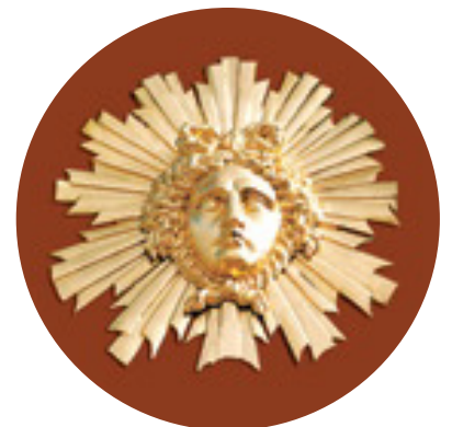
CLUB MED; COURTESY OF WANTED PARIS

● Carré d'Artistes rotates works by 30 up-and-coming artists; they are sold in four sizes, ranging from €45 to €228. 20 rue Glacière, Aix-en-Provence; 66 rue Saint-André des Arts, Paris 6 e . carredartistes.com