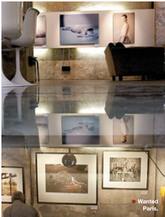
● Wanted Paris.

The Château de Versailles's newly reopened Domaine de Marie Antoinette includes the Petit Trianon, a grotto and a farm complete with animals—don't miss the amazing four-horned goats. Free admission for children under 18. chateauversailles.fr