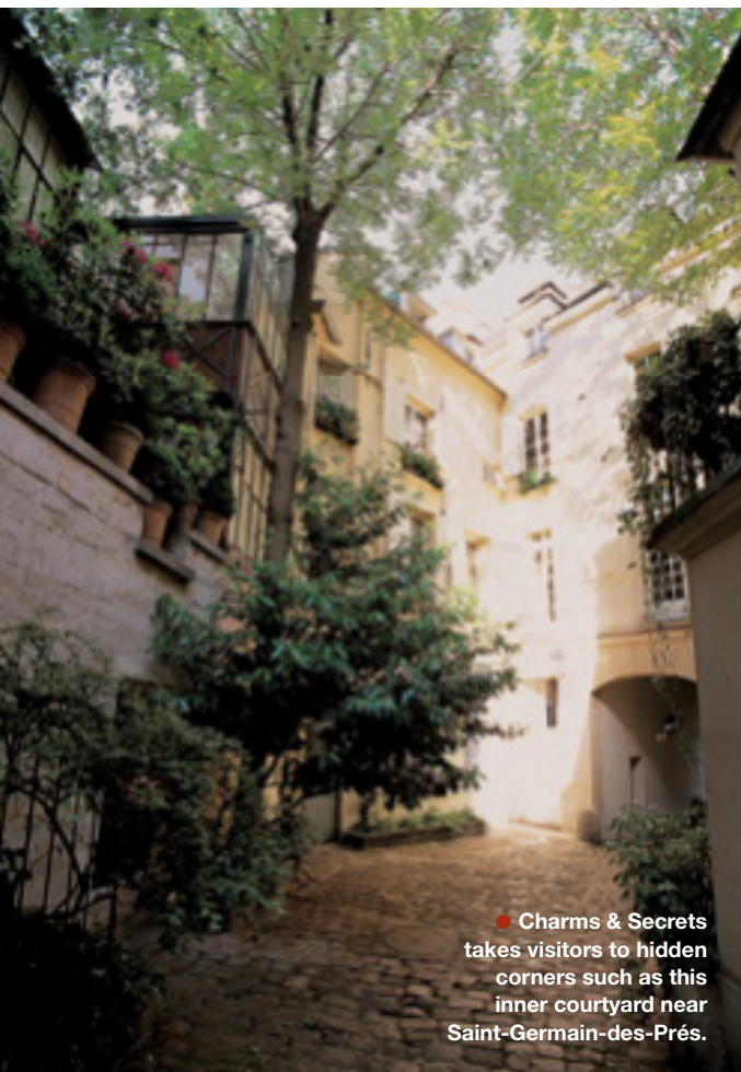
● Charms & Secrets takes visitors to hidden corners such as this inner courtyard near Saint-Germain-des-Prés.